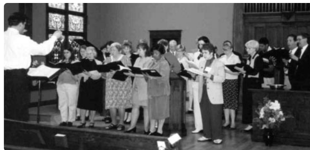
LVPC CHOIR AT THE SANCTUARY DEDICATION