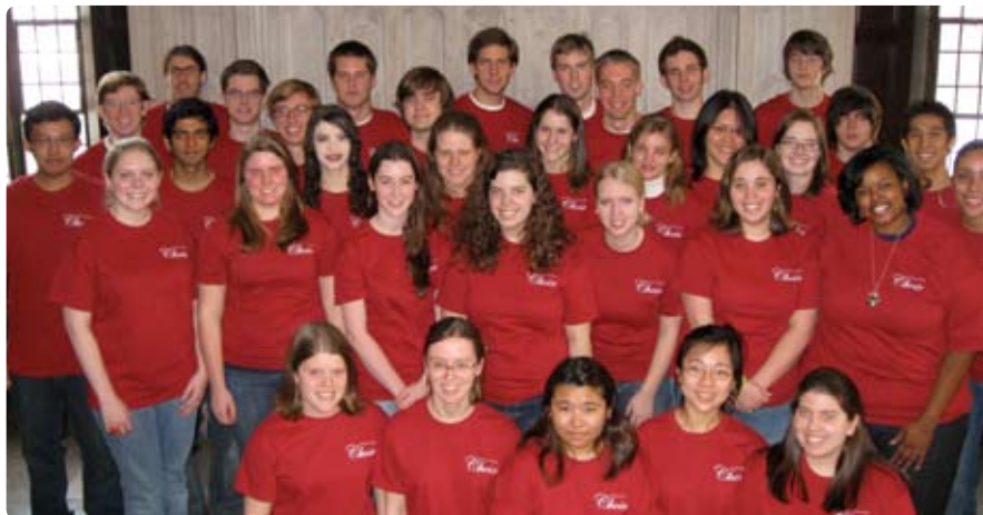
CARLETON COLLEGE CHOIR

The Carleton College Choir will present a free concert in the LVPC Sanctuary on Tuesday, March 18 at 7:00 p.m. as part of their spring concert tour.